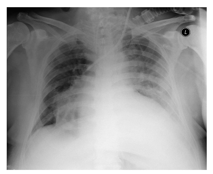
Figure 1. Lung X-ray the day before surgery

A 60-year-old patient was admitted to the University Hospital in Lublin, Poland, for surgical treatment of a trapped diaphragmatic hernia with necrosis of the stomach wall. The patient was admitted to the ward in a serious condition. Total gastrectomy with gastrointestinal disconnection was performed on the day of admission.The patient was transferred from the secondary hospital, where had spent two weeks from the first diagnosis of an incarcerated hernia, but without any attempt at surgical treatment of diaphragmatic hernia. However, the diagnosis was confirmed in computed tomography (CT) scans on the third day after admission.